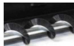
POWERED REAR ROLLING CLEANING BRUSH